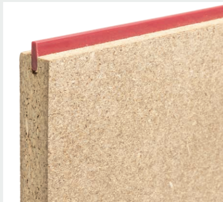
Burgundy Tongue 22mm for 600mm joists*

High quality interior all purpose flooring for use in domestic and some commercial buildings, designed for both platform and fitted flooring construction methods. Also available as Termite Treated.