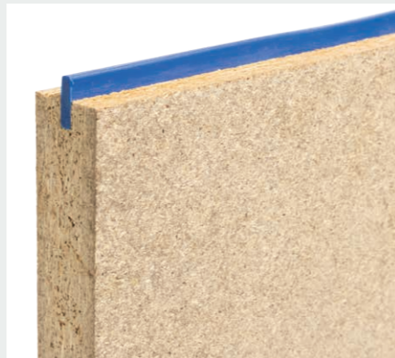
Navy Tongue 25mm for 600mm joists*

22mm thickness allows for a maximum joist span of 600mm centres. Also available as Termite Treated.