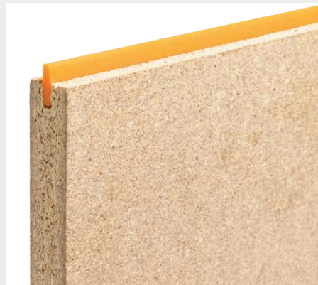
Orange Tongue 19mm for 450mm joists*

High quality interior all purpose flooring for use in domestic and some commercial buildings, designed for both platform and fitted flooring construction methods. Also available as Termite Treated.